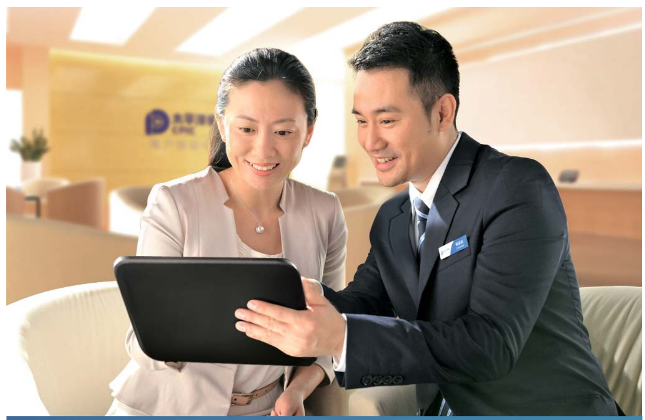
In the first half of this year, the Company explored innovative sales model for the customer relationship management. "Shenxing Taibao", a smart mobile insurance platform, was further implemented. Now, all policies from the agency channel are issued from this smart platform, which improved customer experience and the efficiency of customer resources development.

1.9% as compared to the same period of the previous year. Premiums from new policies amounted to RMB21.946 billion, representing a decrease of 12.0% over the same period of the previous year and premiums from renewed policies amounted to RMB34.324 billion, representing an increase of 13.3% over the same period of the previous year.