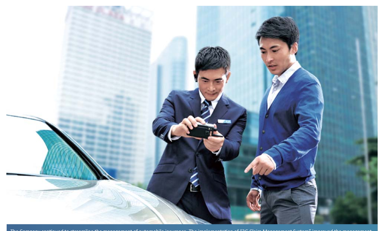
of claims, as such, higher proportion of claims could be processed and settled within 24 hours. And the average auto claims turnaround was reduced by 26.5% as compared to the same period of last year.

representing an increase of 21.4% compared to the same period of the previous year. The Company continued to streamline the management of automobile insurance. The implementation of "3G Claim Management System" improved the management of policy claims, as such, higher proportion of claims was processed and settled within 24 hours. Consequently, the average time for settling auto insurance claims decreased by 26.5% as compared to the same period of the previous year. As such, the customer adherence was enhanced. The renewal rate of commercial auto insurance reached to 63.1%, representing an increase of 1.7pt as compared to the same period of the previous year.